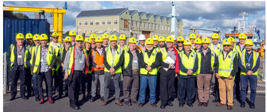
Members of NZ Marine Commercial Vessels Group visit Babcock International (Naval Base), Auckland.

www.mpi.govt.nz/import/border-clearance/ships-and-boats-border-clearance www.customs.govt.nz www.immigration.govt.nz www.maritimenz.govt.nz www.nzmarine.com/directory www.nzmarinevessels.com